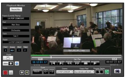
V-Station HD Media Player

Even while recording, you can play back previous clips using the builtin media player. Pull up the playlist by project and review footage. Step frame by frame, or play in slow motion.